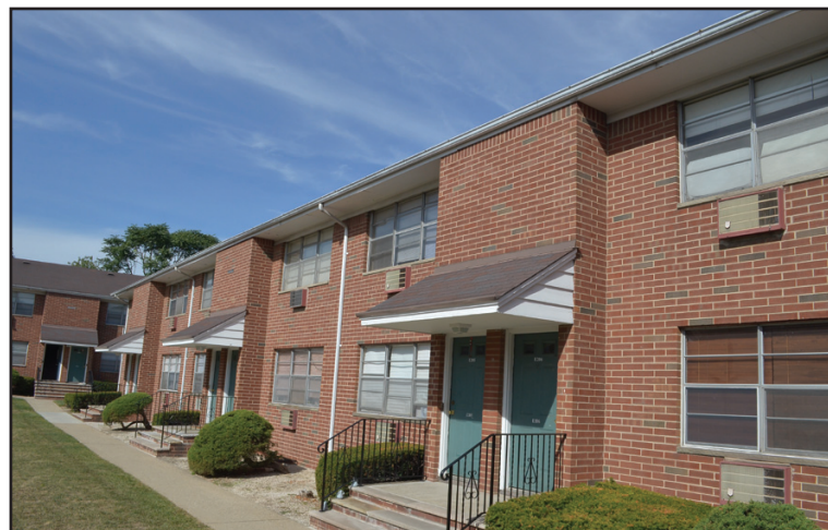
Bogota, NJ Garden Apartments

original developer and owner, Landmark Development Co. ■